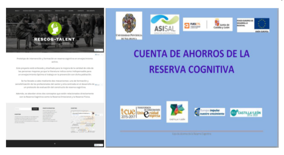
Illustration 1. Cognitive reserve innovation project Rescog-Talent website.

We consider this study highly innovative because most of the innovations applying ICTs to caregivers [51] have focused on intervention on dementia awareness or coping skills (behavioral alterations, emotional selfcare). Moreover, the protocols for MCI screening through ICTs (online assessment), are based solely on information from the caregiver (professional or family member). In our investigation, we combine an objective assessment of cognitive performance and associated variables with the tests answered by the key informant (caregivers).